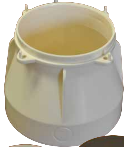
Optional reducer APE RED92-78