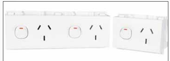
Available in single or double

Clipsal's new range of DIN Rail Mounted Switched Sockets provide a fast, convenient source of power, letting you get on with the job.