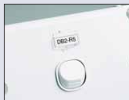
2. Insert label