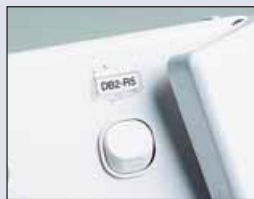
3. Fit cover