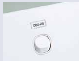
4. Finished product