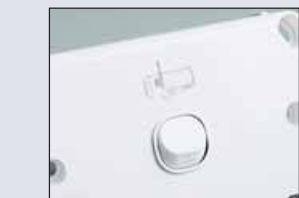
1. Attach window

Both these styles are designed to fit securely behind the clear I.D. window.