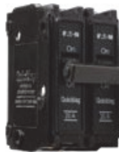
Quicklag MCB 2 pole