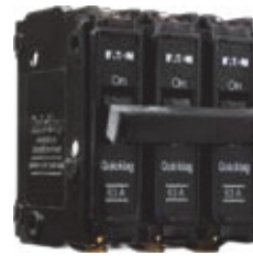
Quicklag MCB 3 pole