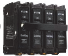
Quicklag MCB 4 pole