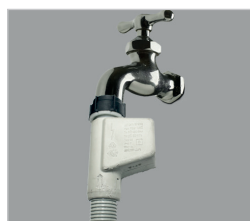
AQUASTOP FLOOD PROTECTION