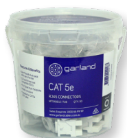
Tub - 50 Pack