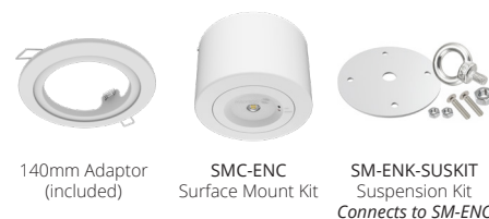
140mm Adaptor (included)