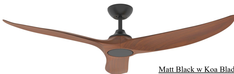
Matt Black w Koa Blades