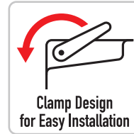
Clamp Design for Easy Installation

The O4MM-RP04 is a medium-sized recessed wall box for use with AV, data and power outlets. RP04 features two wall plate installation locations and two integrated brush plates, one with a Clipsal® fitting mech point for cable management and fit-off. Matchmaster's recessed wall box is simple to use with its cut-out template and smart folding wall clips to lock the unit in place quickly. The RP04 is perfect for housing outlet plates such as power, TV, A/V, data points and all general-purpose outlets. In addition, it is ideal for use behind kitchen appliances, A/V cabinets, flat-screen TVs, bedroom furniture, and any appliance or furniture placed flush against the wall.