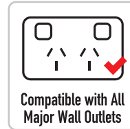
Compatible with All Major Wall Outlets