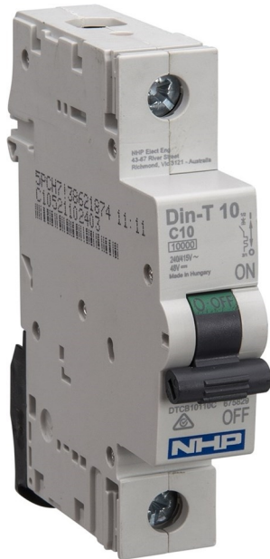
Representative Photo Only (actual product may vary based on configuration selections)