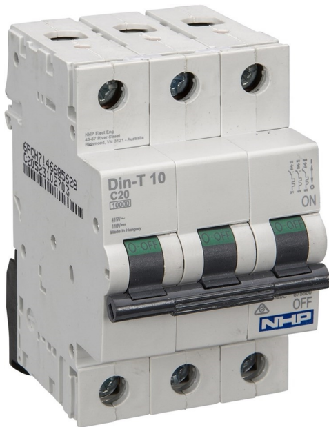
Representative Photo Only (actual product may vary based on configuration selections)