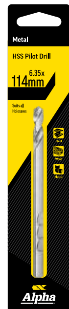
CARDED – 1 PCE Supplied in hangable card