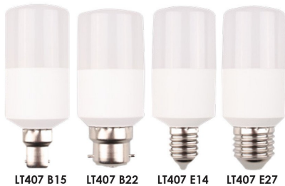
LT407 B15 LT407 B22 LT407 E14 LT407 E27