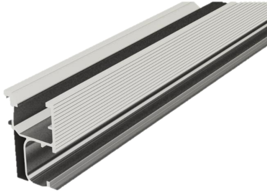
ECO Rail Part No.: ER-R-ECO/XXXX