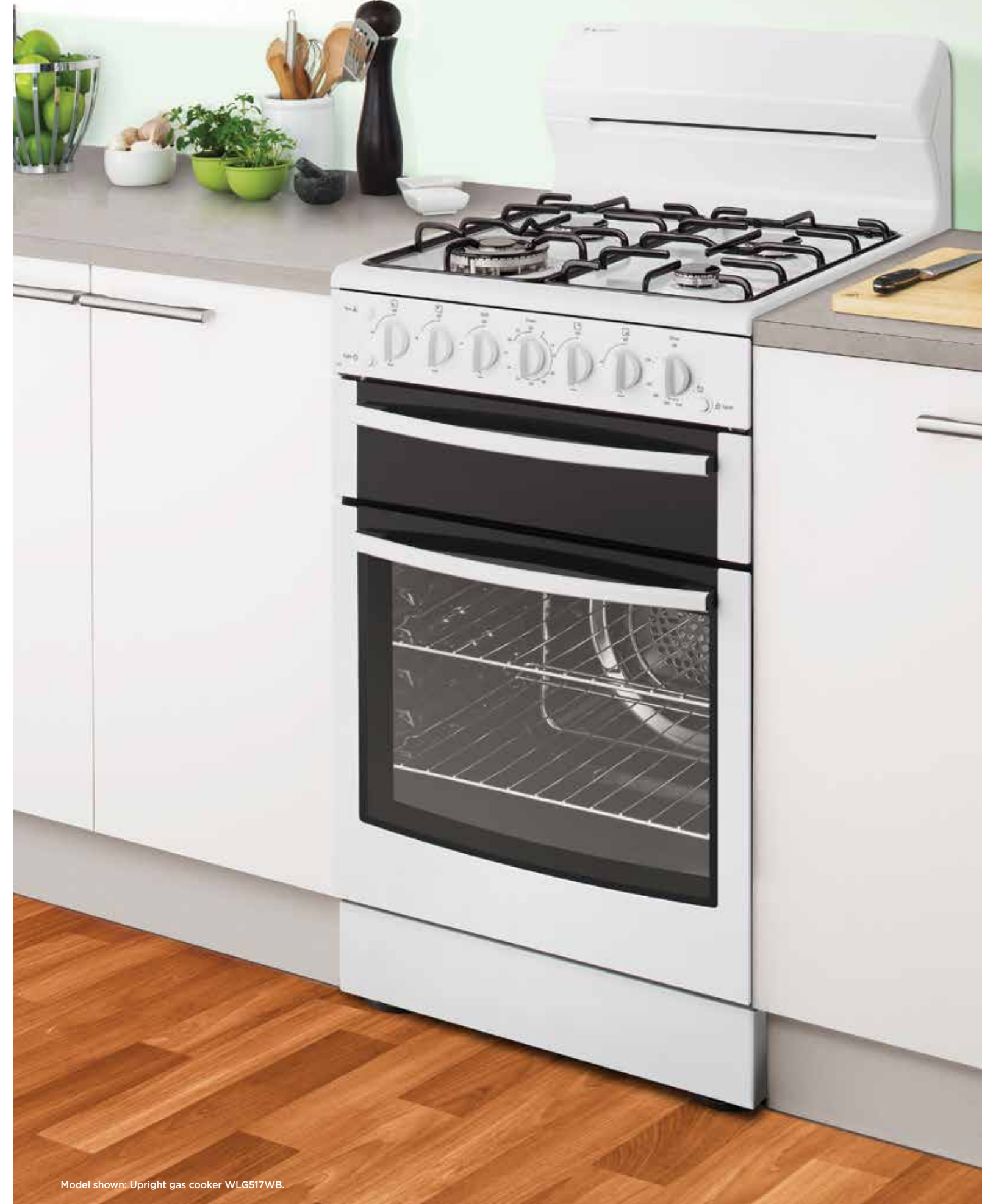
Model shown: Upright gas cooker WLG517WB.

Dimensions refer to overall dimensions of the product, not actual cut-out sizes. Depth excludes knobs and handles.