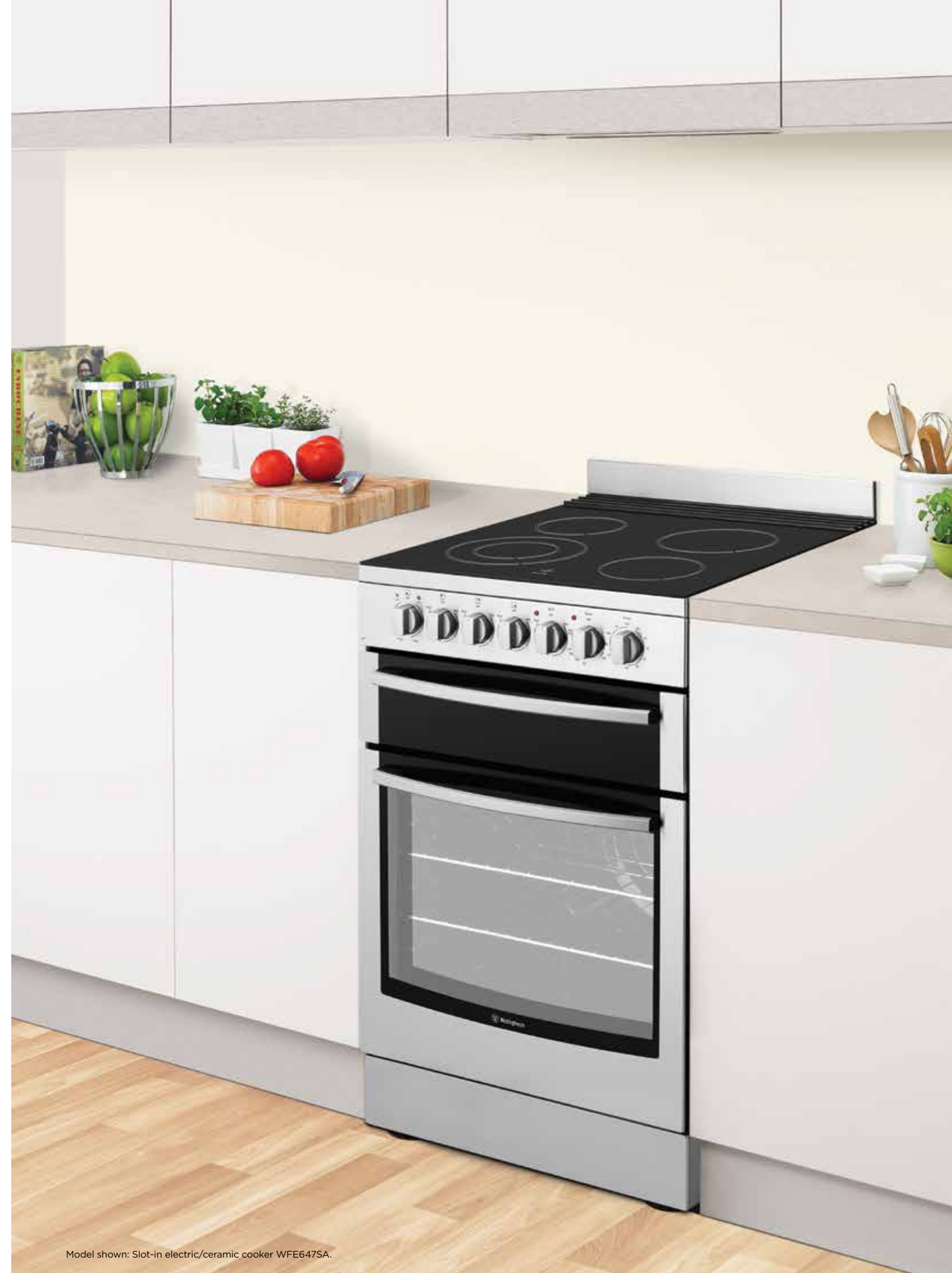
Model shown: Slot-in electric/ceramic cooker WFE647SA.

Created with safety in mind, the flame failure safety device will immediately shut off the gas supply if the flame on the cooktop is unexpectedly extinguished.