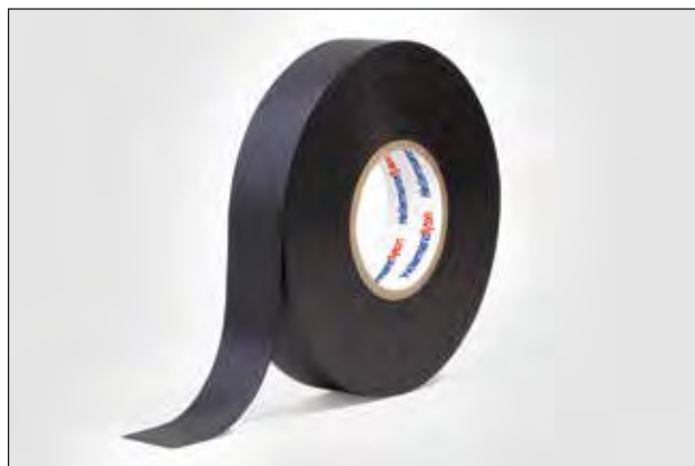
HelaTape Power 700 is a self-amalgamating medium voltage rubber tape.

HelaTape Power 700 (PIBR) (0.5mm x 19mm x 10m)