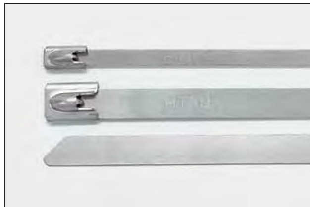
Stainless Steel Cable Ties, uncoated.