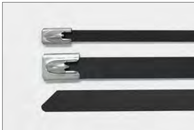
Stainless Steel Cable Ties, coated